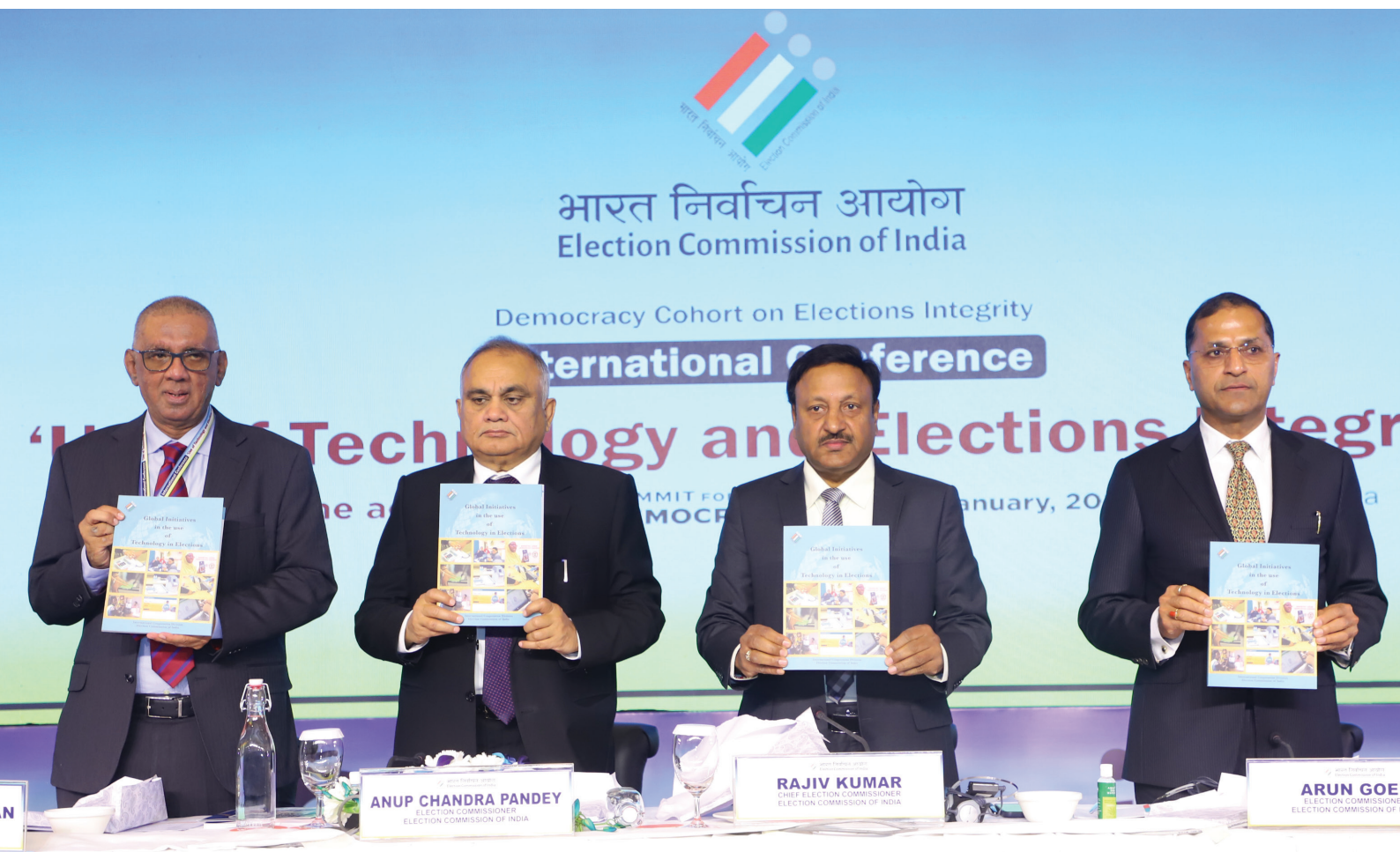
Global Initiatives in the Use of Technology in Elections