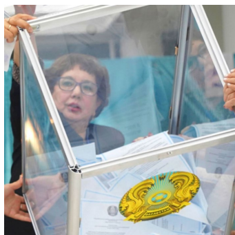
Election Snapshot: Kazakhstan