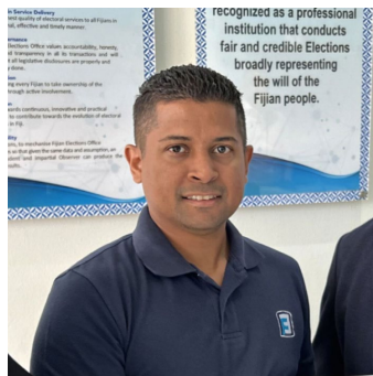
Election Snapshot: Fiji