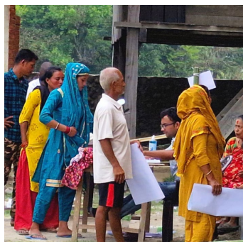
Election Snapshot: Nepal