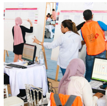
Election Snapshot: Tunisia