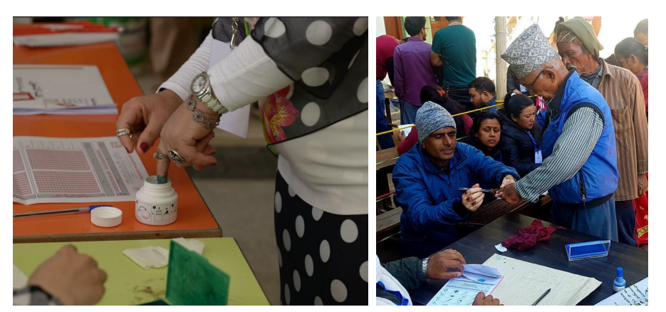
Indelible ink can be applied by the poll workers or by voters directly. Applicators that reduce the need for human-to-human contact should be preferred.

Most biometric scanners and electronic voting machines require that voters touch a screen. Just like the recommendation for biometric voter registration devices, EMBs must contact manufacturers to get detailed instructions on which products can be used and how to use them to sanitize the equipment without damaging it. Touchless fingerprint technology and facial recognition devices, when available, are even better options as they avoid the risk of fomites altogether. Electronic voting machines usually