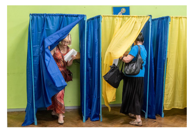
Although curtains help keep the secrecy of the vote in Ukraine, they should be avoided during the COVID-19 crisis to reduce the chance of virus transmission.

The layout inside each polling station also must be carefully planned. The placement of the tables and the seats for poll workers should respect the required physical distance, and officials should control the flow of voters at each stage of the polling process to avoid person-to-person contact and allow time for sanitization of any equipment. EMBs should also consider eliminating any steps that might lead to unnecessary touching of objects. For instance, EMBs might prefer buildings with fewer doors or doors that open and close automatically to avoid handling of doorknobs and using fixed booths rather than curtains to avoid voters touching the cloth. Multiple-person seating, especially benches and sideby-side chairs, should be removed, and the polling