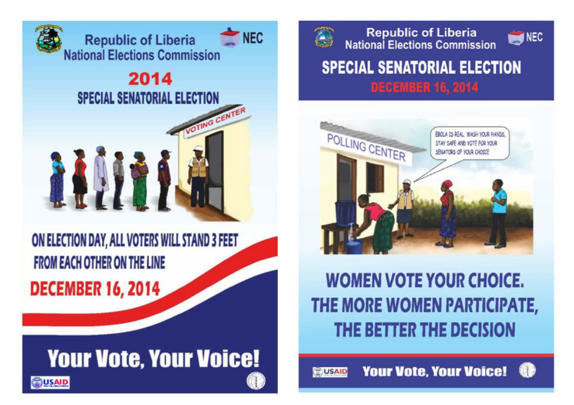
Examples of voter education materials from Liberia during the 2014 Ebola outbreak.