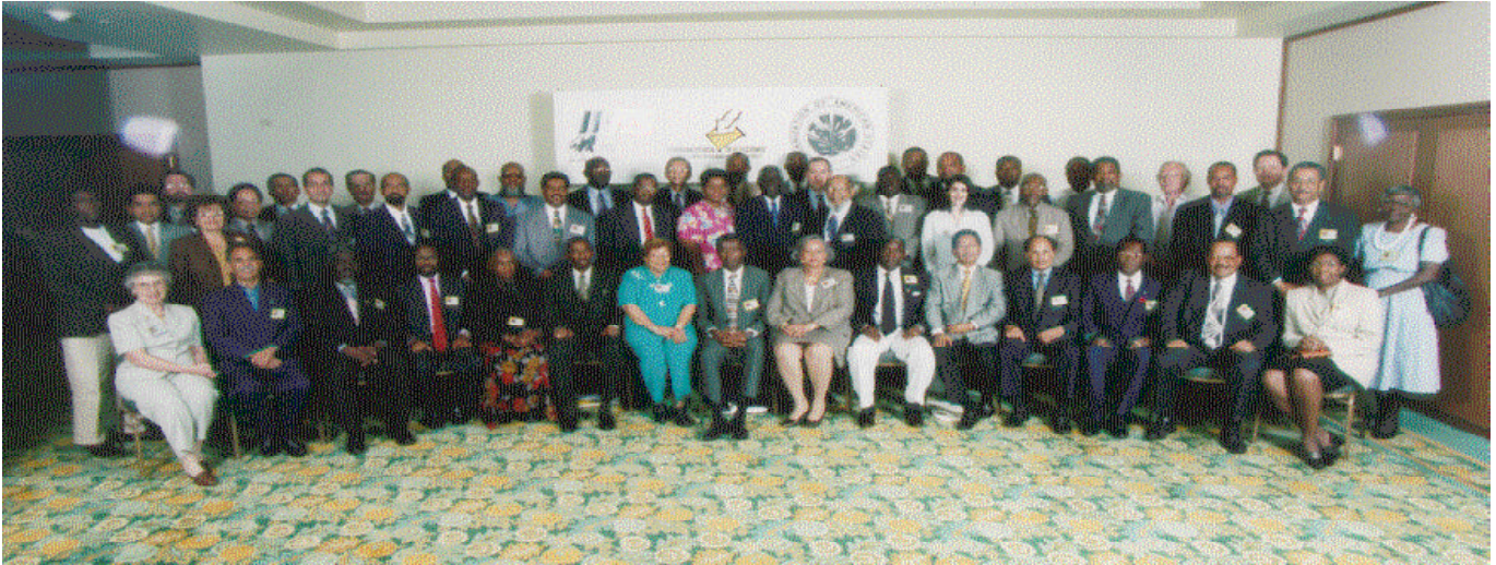
Delegates and other participants to the Founding General Assembly of the ACEO.

indicated their intention to do so as soon as governmental permission is obtained. The 15 founding members are Antigua and Barbuda, Belize, British Virgin Islands, Cayman Islands, Grenada, Haiti, Jamaica, Montserrat, Puerto Rico, St. Kitts and Nevis, St. Lucia, Suriname, Trinidad and Tobago, Turks and Caicos, and US Virgin Islands.