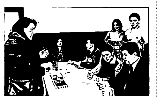
GONG observers in a polling station

After visiting a polling station a mobile team would fill in form M1.