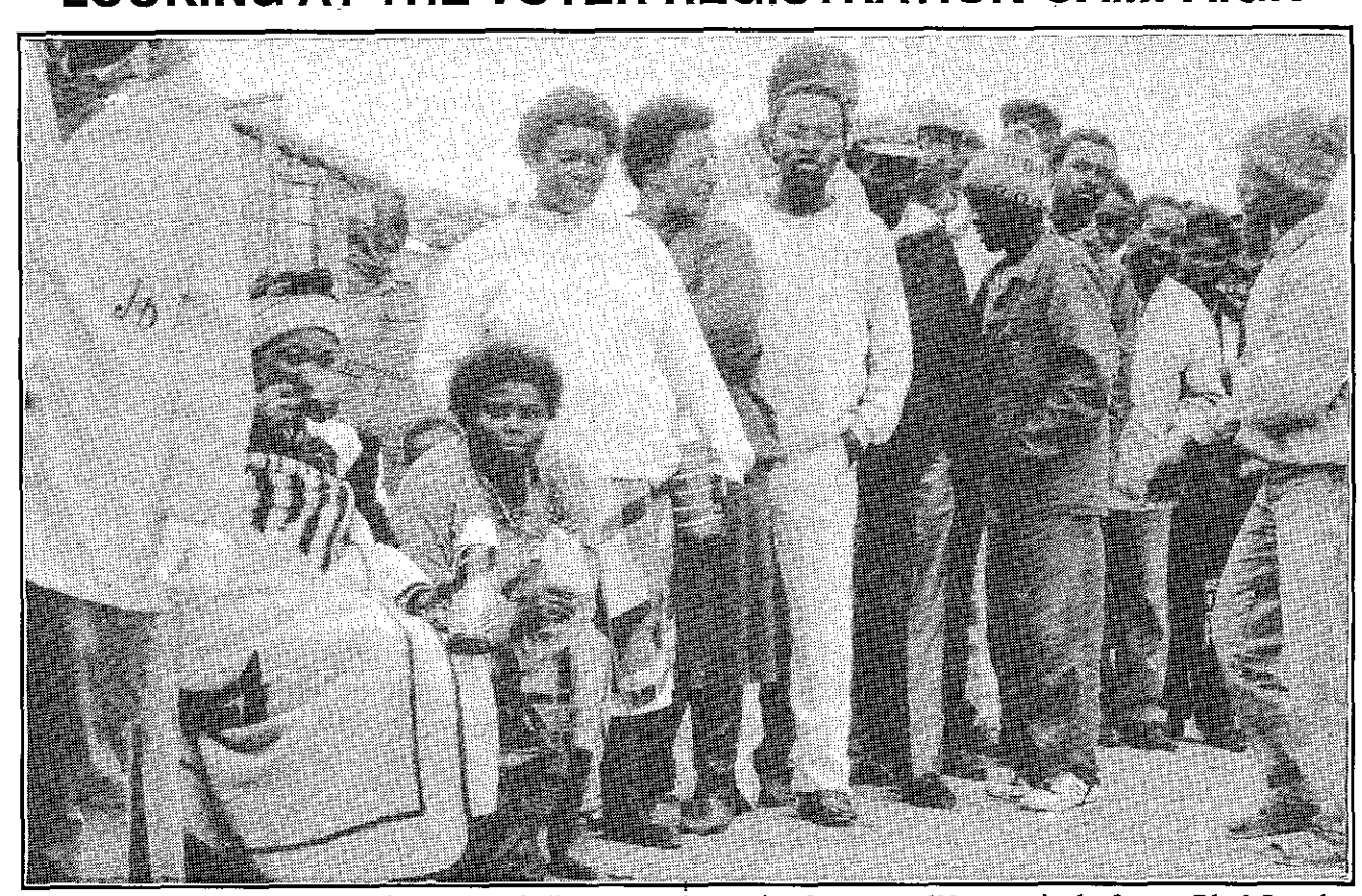
In the Local Government Elections, there shall be one voting station for every 2500 voters in the former Black Local Authority areas, and one voting station for every 4000 voters in the former White Local Authority areas

The latest voter registration statistics for the upcoming local government elections indicate 32% of potential voters have registered nationally by 19 April 1995. According to the Election Task Group (ETG) the total number of registered voters in each of the provinces was as follows on the 19 April 1995: Western Cape - 56,6%; Northern Transvaal - 39,4%; Northern Cape 38,7%; Free State - 37,1%; North West - 35%; Eastern Transvaal - 32,9%; Gauteng - 26,4%; Eastern Cape - 24,6% and Kwazulu-Natal - 14,3%.