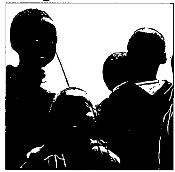
What began as a last-ditch attempt to provide food and daytime shelter for 28 children in 1993 has become a desperately needed child care and community center for 234 children in Soweto's Orlando West. Story on page 4.