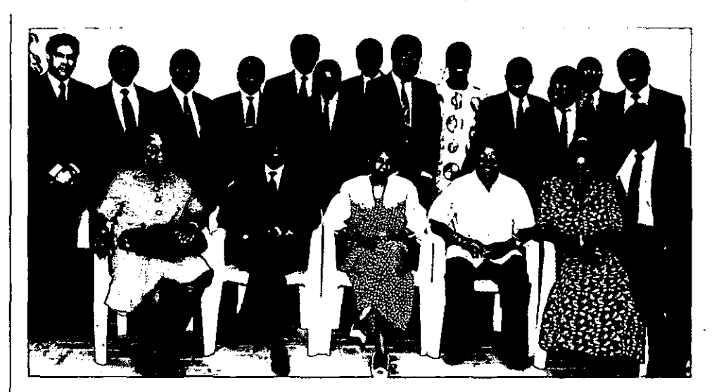
The Gaborone meeting delegates posing for a group photo after the official opening.

esolutions only make meaning when implemented. The Arusha Conference of Political Parties in the Transition to Multiparty Democracy organised by the Eastern and Southern African Universities Research Programme (ESAURP) in June 1993 started becoming a meaningful reality when the Gaborone meeting began implementing one of the Arusha resolutions.