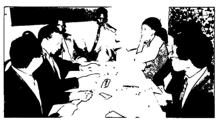
Sub-Committee members discussing Election Monitoring and Regional Forums