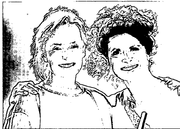
Tool kits provided by: Charming Shoppes, Inc.