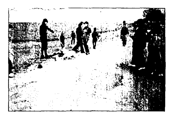
Locations for the Actions: Telavi and Telavi communities.

Other Supporters: NGOs "Life Fund", "Woman and Universe", Telavi Municipality and Local representative bodies, local mass media, Telavi Forest Farming Department, Telavi Communal Service, GWS (Georgian Wine and Spirit) Wine Factory, citizens.