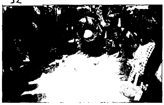
"Global Youth Service Day" in Rustavi

All participants were awarded by IFES Diplomas and small gifts.