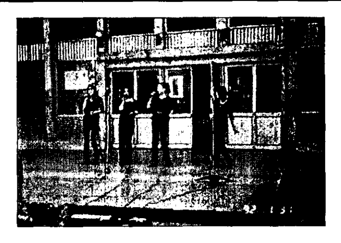
Rustavi (Kvemo Kartli Region)

All participants were awarded with IFES Diplomas and small gifts.