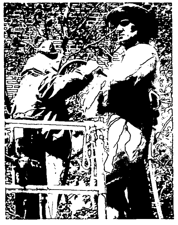
A conservator polishes a Rockville monument.

• International Relations. The Secretary of State's office welcomes foreign dignitaries, ambassadors, business executives and other guests. The Secretary often represents the Governor at official meetings in Maryland and abroad.