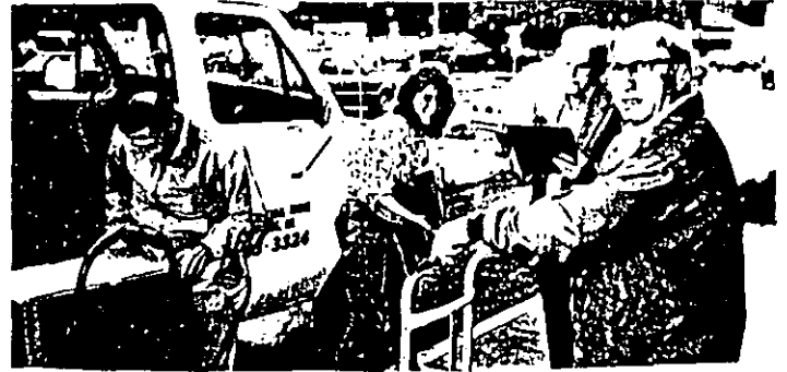
Board Employees Receiving Ballots

Beginning August 14, absence on election day from the city or entity where an individual lives will not entitle that voter to cast an absentee ballot. Under a new, broader interpretation of the word "jurisdiction", a person must now be out of St. Louis County on the date of the election to vote an absentee ballot. Other reasons provided for under Missouri Statutes for voting absentee still apply.