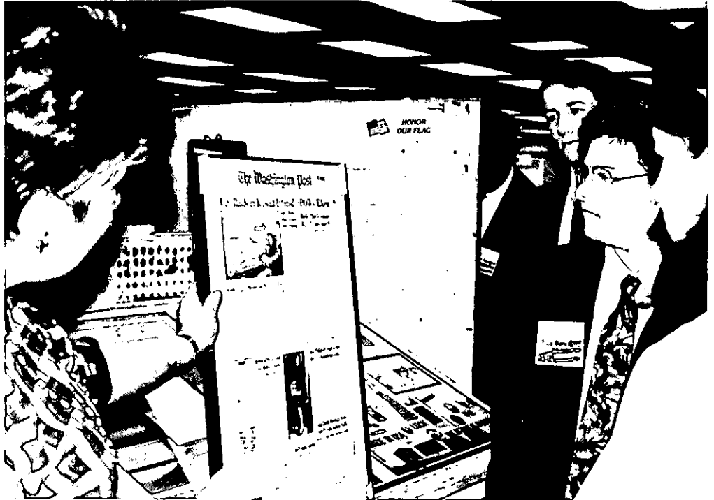
1991 Newsweek Scholarship winners toured The Washington Post building. Afterwards, they attended a luncheon in their honor in Katharine Graham's office.

Due to limited resources and to assist as many students as possible, Presidential Classroom rarely awards full scholarships. Scholarship applicants who do not receive an award or are unable to attend the program for other financial reasons will receive refunds of their $100 deposits.