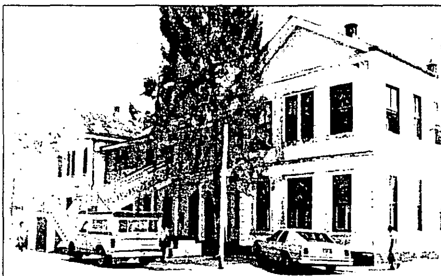
Supreme Court Building