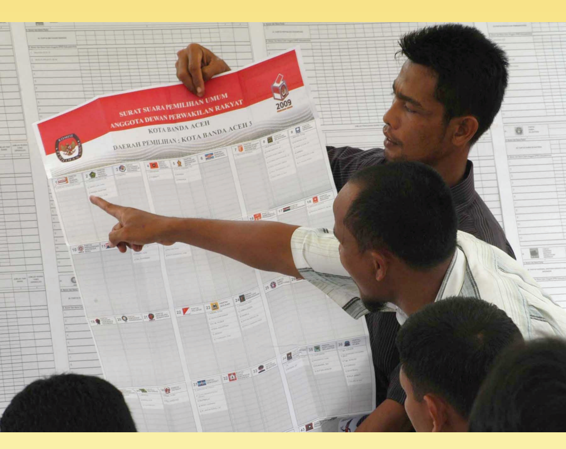
Polling staff in Banda Aceh count votes in the presence of election observers during the 2009 Indonesian legislative elections.