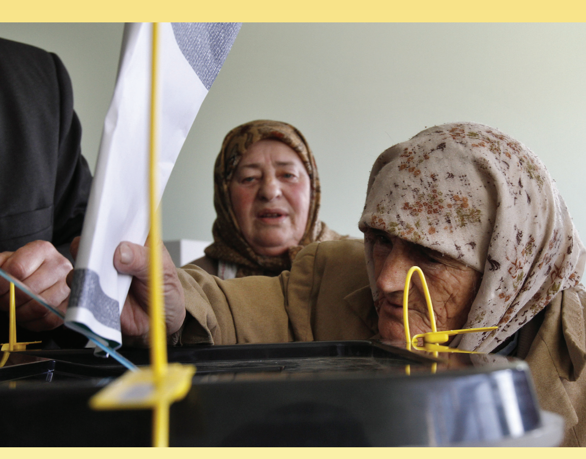
An elderly Kosovar woman casts her ballot at a polling station in the village of Trstenik, central Kosovo, on Sunday, 9 January 2011. Election officials say polls were opened in five Kosovo regions where voters recast ballots after authorities found fraud was committed in the 12 December 2010 general election.