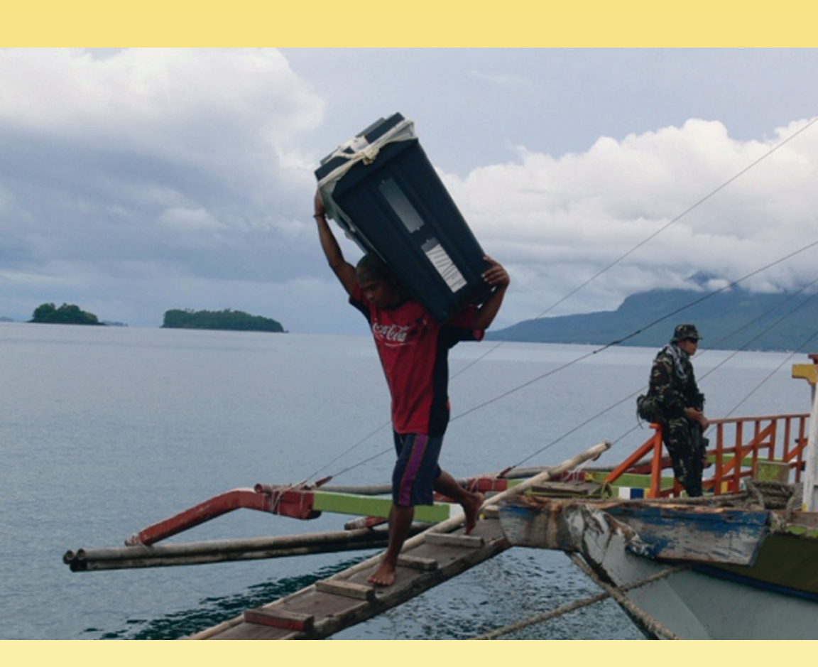
Ballot boxes containing ballots cast during the May 2010 elections in the Philippines, now subject of an election protest case, are sealed and retrieved to be brought to Manila for review by the House of Representatives Electoral Tribunal.