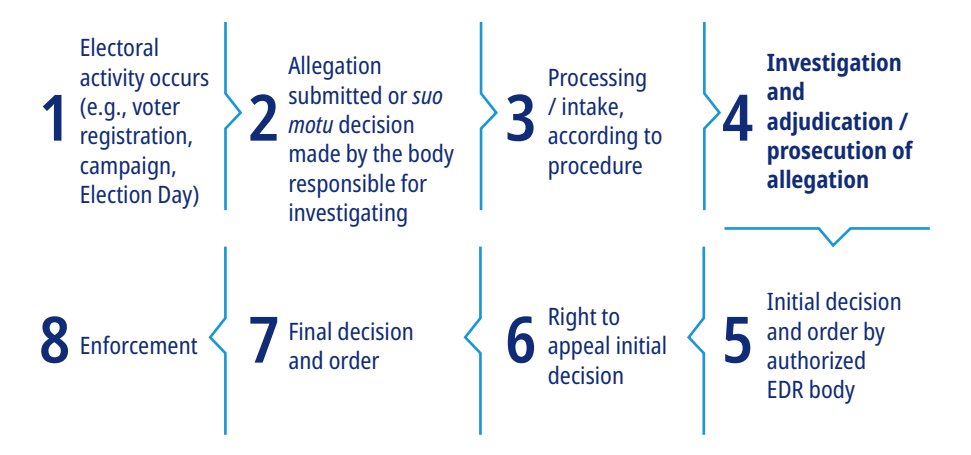
Figure 1: Basic scheme of an election dispute resolution process:

According to the United Nations Development Programme's (UNDP) Investigation Guidelines, the investigative process contains three parts: assessment, investigation, and reporting.<sup>6</sup> These three stages offer a helpful framework for conducting a thorough investigation.