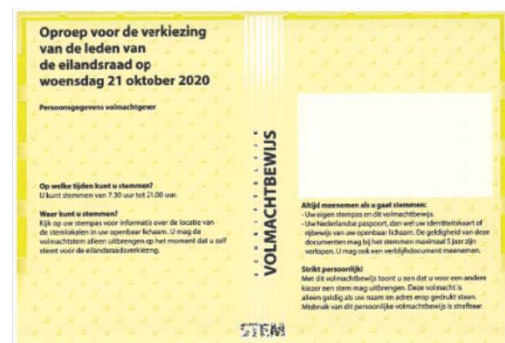
Written voter proxy sample

The ACE Electoral Knowledge Network indicates that proxy voting is permitted under the law in very few jurisdictions globally (both the Netherlands and the United Kingdom offer the option), noting that “a proxy vote may be given where a voter is unable to attend a voting station through infirmity, employment requirements, or being absent from the area on