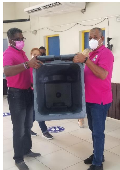
Voting bureau members display empty ballot box before polling

The voting locations were laid out to facilitate adherence to COVID-19 protocols. 62 The staff of the voting bureau sat behind plexiglass dividers which separated them from voters, while they themselves sat six feet apart from each other. There were markers on the ground indicating where voters were to stand to ensure they remained two meters apart. The hands of voters were sanitized three times during the process: at the entrance, after interacting with the chairperson of the voting bureau before voting and upon leaving the polling station. Voters used separate doors to enter and exit the locations to ensure they did not have to come in close contact with each other. The voting booths and the pencils were sanitized immediately after each voter exited the voting booth. The vast majority of voters adhered to the COVID-19 protocols by observing social distancing, sanitizing their hands and wearing masks. They also