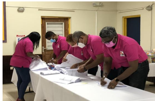
Polling officials count ballots in Lion's Den at close of polls while voters, candidates, and journalists watch

Directly following counting, the sealed results packets and results form ( proces-verbaal N 10-1 ) were handed over to the police for safe keeping. Final results were publicly declared two days later, by which time the IFES Team had departed the island, at a meeting of the Central Voting Bureau. The final results showed a total of 1616 votes cast (1586 valid votes, 14 blank votes, 16 invalid votes), with 815 votes for the PLP, 647 DP and 124 for UPC. At the time no explanation was given for the difference of one vote cast. 81 Interestingly, the DP received more votes at the Lion's Den and the PLP received more votes at the Sports Center. Based on the final results, the seat allocation remained the same as announced at the time of the preliminary results announcement.