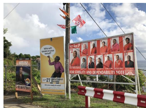
Political party and voter advertising

In normal times, the principal/central electoral committee is composed of five members, including a presiding officer, a deputy presiding officer and three deputy members. The Island Governor acts as presiding officer, and other members are appointed by the Island Executive Council. While there are clear eligibility requirements in the law, the appointment and dismissal process are not further elaborated, and it is conceivable in such a small community that these appointments would be called into question as not being impartial. Presumably, this electoral committee will be