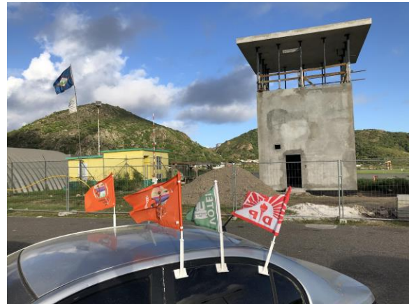
Campaign flags on a voter's vehicle

The voter education campaign was disseminated through printed fliers, posters and billboards. There were also advertisements placed on local radio stations. There is no functioning local TV on Sint Eustatius. In addition, ordinances were issued clearly outlining voting roles and responsibilities and COVID-19 safety protocols. Social media and the government website were widely used by the Government of Sint Eustatius to disseminate updates on the election as well as COVID-19. Voter education was in both Dutch and English, but not Papiamentu or Spanish. 86 The general consensus from all interlocutors was that the information provided was both relevant and timely.