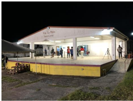
Lion's Den Polling Station

Voting progressed smoothly throughout the day with voters casting their ballots in secret and with no visible signs of intimidation. Approximately six electors had difficulty communicating with the polling officials, in part due to the ballots only being available in Dutch. Voting bureaus closed on time at 9:00 pm, as there were no electors in line at closing time. In addition, approximately ten electors were turned away due to a lack of or improper identification. 63