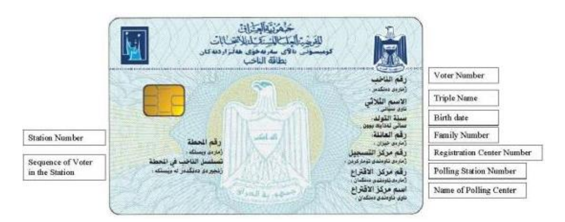
Figure 4: Electronic Card

Electronic voter cards are the older cards issued by the Independent High Electoral Commission that include the voter's data (full name, voter number, year of birth, family number, registration center number and name and number of polling station). These cards have an embedded chip that contains biographic data only. Voters with electronic cards will be asked to provide prints from all 10 fingers.