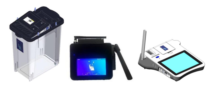
Figure 1: PCOS, VVD and RTS

At all polling stations, PCOS machines will count ballots electronically as ballot papers are inserted. One polling station in each polling center will be randomly selected for a manual count. If the difference between the manual and electronic count is greater than 5 percent, all polling station results in that polling center will also be counted manually, and the manual count will prevail.