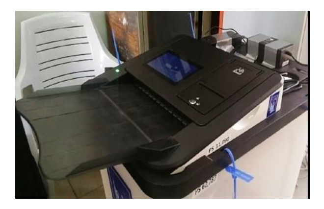
Figure 2: PCOS