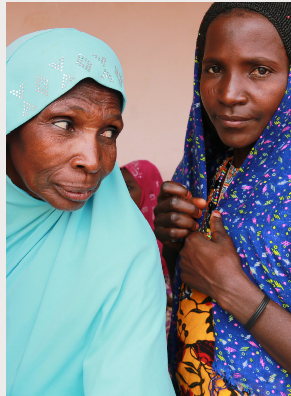
Fulani women in Nigeria queuing to get registered to vote in Kwara state.