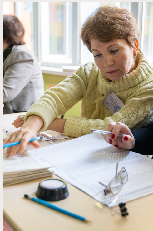
Poll workers in Ukraine examine the voter list during the first-round presidential election on March 31, 2019.