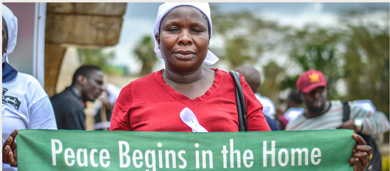
A Kenyan woman participates in a campaign for peace.