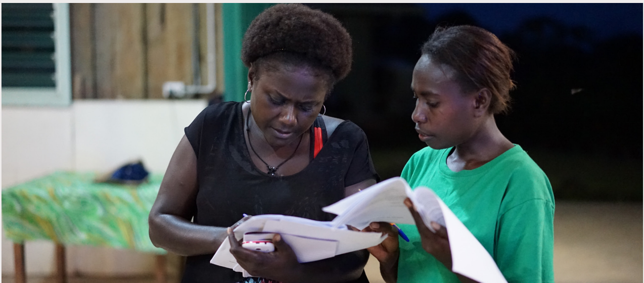
Two women take part in a mock polling observer training in the Autonomous Region of Bougainville.

The insights from both the literature review and expert consultations directly shaped the indicators that were adapted and tested during the pilot in Nigeria, as well as the content of this global framework.