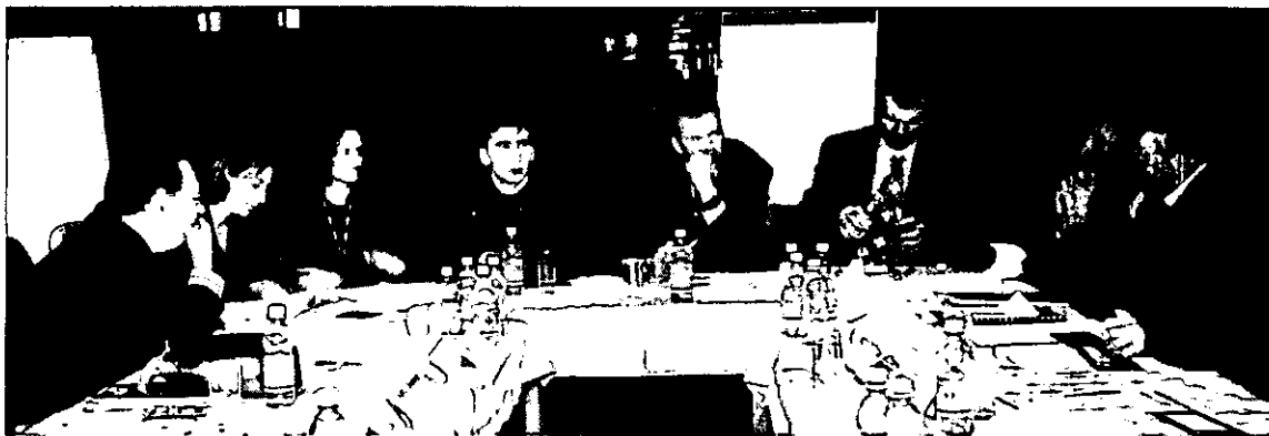
Participants discuss the role of the CEC at the Discussion Forum.

A small number of participants differed from the majority opinion, believing that political parties should not be represented on PSCs and that it would be better if PSCs were recruited from other civil society organizations.