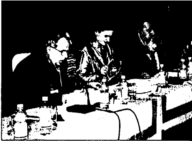
Kosovar Serbian and Kosovar Bosniak participants discuss the future of election administration during one of the workshops at the Discussion Forum.

Taking this into consideration, the following suggestions were put forward concerning the structure of a future Election Management Body in Kosovo.